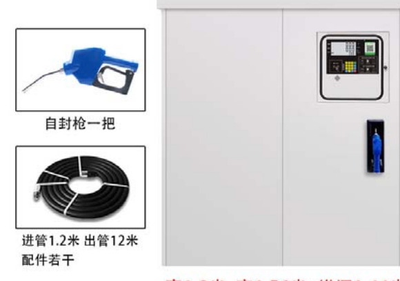
高1.9米 宽1.56米 纵深1.44米